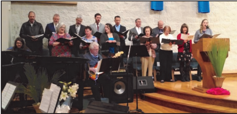
Our wonderful choir, musicians, and Reflections Dancers help the Blessed Trinity parish community celebrate well!