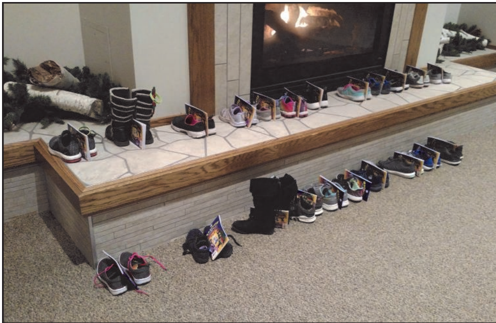
Our grades 1 - 4 children took part in St. Nicholas Prayer Services last week. Following an ancient custom, the children were asked to leave their shoes outside of the church space and were surprised to find treats in their shoes after praying!