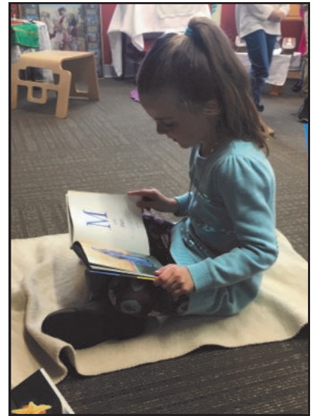
Parish children learn about their Catholic faith in the Atrium.

More information is available by calling the parish office at 652-3259.