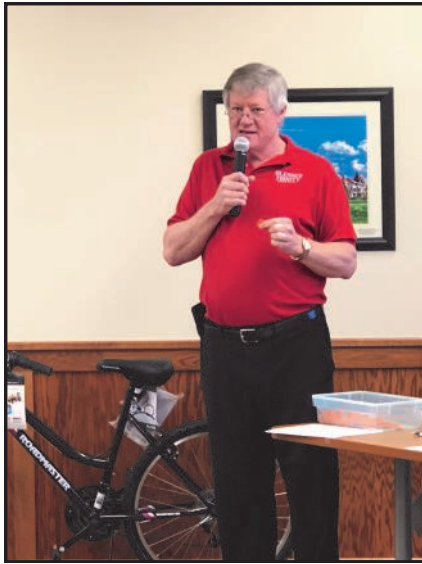
Last Sunday's Family Breakfast was lots of fun! Thanks, Men's Club!