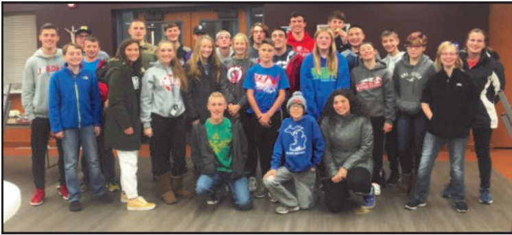
Blessed Trinity youth gathered last Sunday to discuss and paint what they were thankful and grateful for.