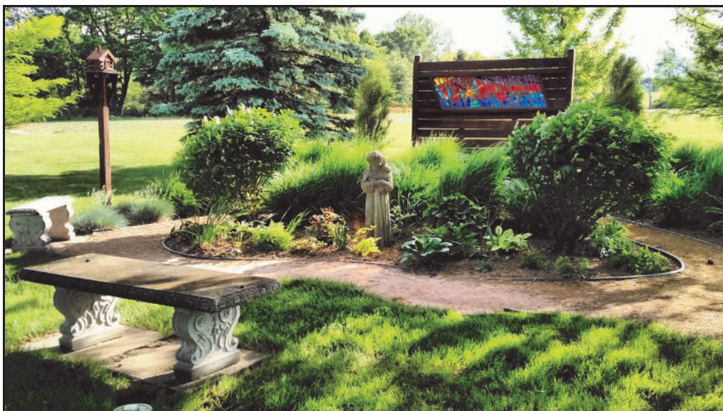
Pictured above is the St. Francis of Assisi Prayer Garden at Blessed Trinity.