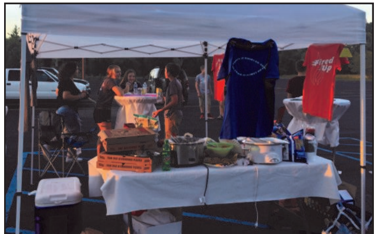
Youth Ministry tailgate fun!