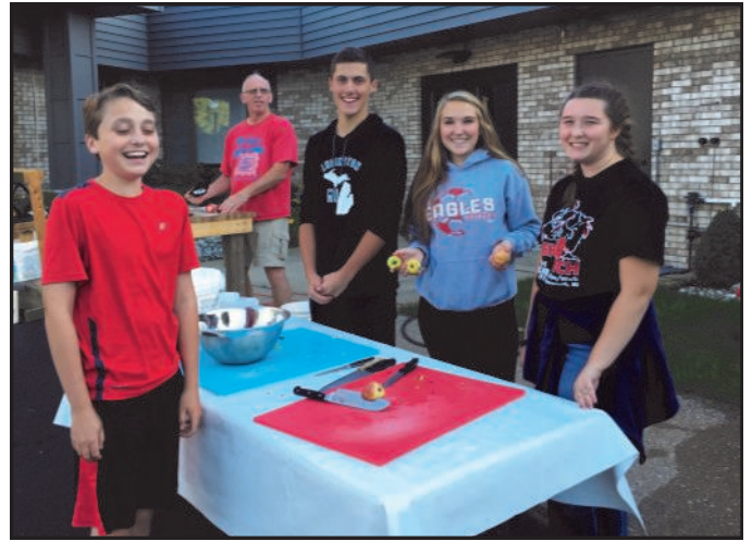
Making apple cider is fun!